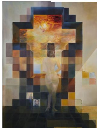
Gala Contemplating the Mediterranean Sea which at Twenty Meters Becomes the Portrait of Abraham Lincoln-Homage to Rothko (Second Version) c. 1976