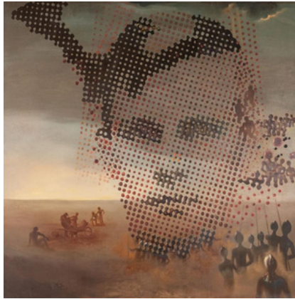
Portrait of My Dead Brother c. 1963