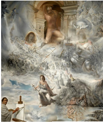
The Ecumenical Council c. 1960