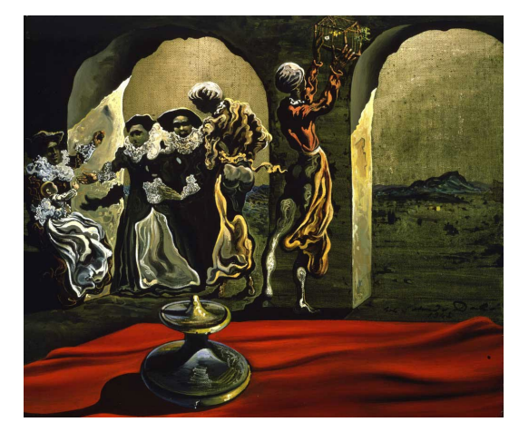
Salvador Dalí, Disappearing Bust of Voltaire , 1941, oil on canvas

Positive shapes are the focal points of a picture, or what the viewer focuses on. Negative shapes are the areas surrounding the part of the picture that the viewer sees or focuses on. Dalí was a master at using positive and negative space in his paintings. In Disappearing Bust of Voltaire (1941), Dalí's uses color and negative/positive space to create an optical illusion. The black dresses of the two women under the archway create negative space and the shadows of Voltaire's face. The white of their clothing creates positive space for the light areas of his face.