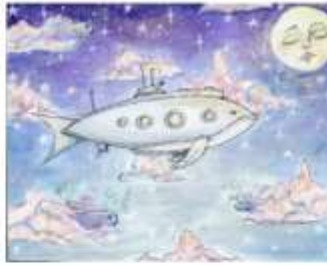
Anya O'Neill Dreamscape