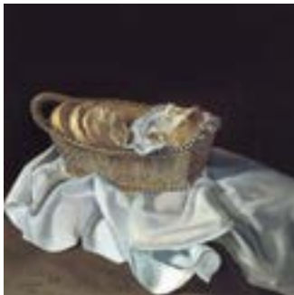
Salvador Dalí The Basket of Bread (1926), 12 1/2 in x 12 1/2 in