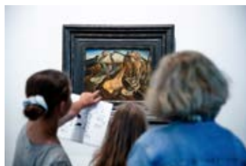
Daddy Longlegs of the Evening–Hope!, 1940, Oil on canvas. ©Salvador Dalí. Fundació Gala-Salvador Dalí, (Artists Rights Society), 2021 / Collection of the Salvador Dalí Museum, Inc., St. Petersburg, FL, 2022.