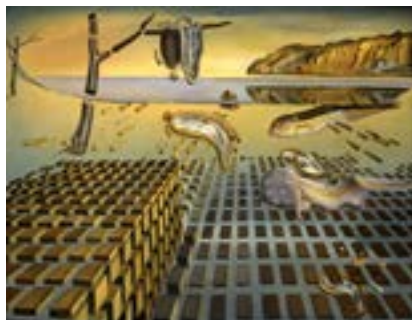
Salvador Dalí The Disintegration of the Persistence of Memory (1952-54), 10 in x 13 in