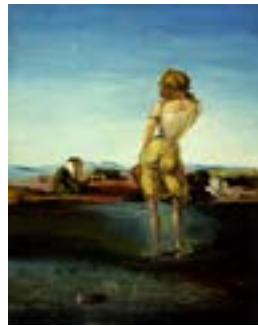
Salvador Dalí Girl with Curls (1926), 20 in x 15 3/4 in