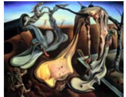
Salvador Dalí Daddy Longlegs of the Evening-Hope! (1940), 16 in x 20 in