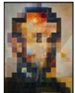
Salvador Dalí Gala Contemplating the Mediterranean Sea which at Twenty Meters Becomes the Portrait of Abraham Lincoln-Homage to Rothko (1976), 99 1/4 in x 75 1/2 in,