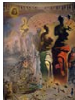
Salvador Dalí The Hallucinogenic Toreador (1969-70), 157 in x 118 in