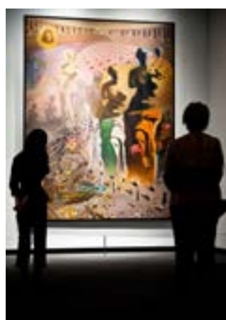
The Hallucinogenic Toreador, 1969-70, Oil on canvas. ©Salvador Dalí. Fundació Gala-Salvador Dalí, (Artists Rights Society), 2021 / Collection of the Salvador Dalí Museum, Inc., St. Petersburg, FL, 2022.